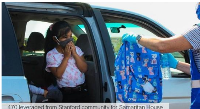
470 leveraged from Stanford community for Samaritan House