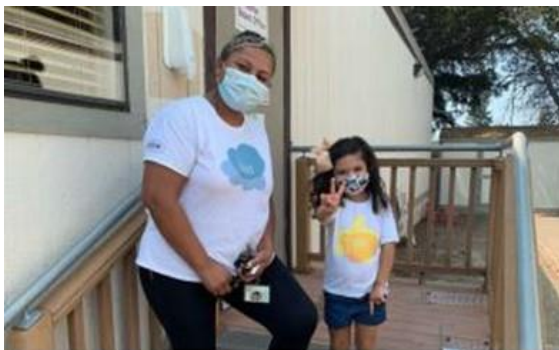
Izzi Early Education Back to School Health Fair