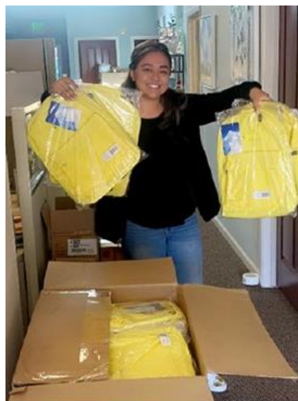
100 children received summer school kits at One Life Counseling