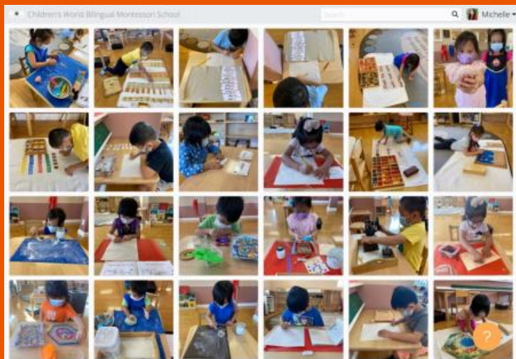
Photo featuring 2-6 year old children